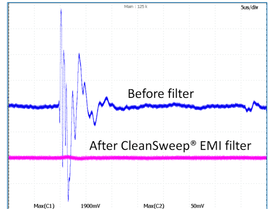
Typical Performance (Differential Mode)