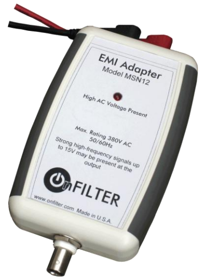
Hand-Held EMI Adapter MSN12