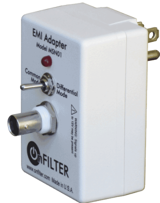
Plug-In EMI Adapter MSN01

www.onfilter.com for more detailed information. Contact us at info@onfilter.com .